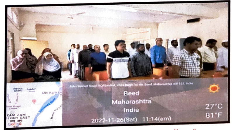
Faculties and students during group reading of Preamble to the Constitution of India.