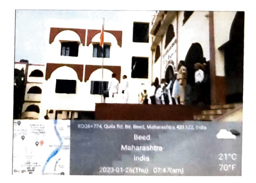
Principal Milliya Arts Science & Mang. Science College,Beed,