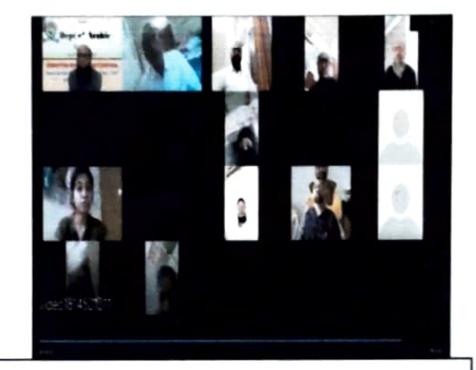
The Participants in the event

Topic: PRIZE DISTRIBUTION CEREMONY Time: Dec 26, 2022 12:00 PM Mumbai, Kolkata, New Delhi Join Zoom Meeting https://us02web.zoom.us/j/88090722917?pwd=YWVTeStNTDd3OTYvSGtHMity MXl2dz09 Meeting ID: 780 8894 9758 Pass code: 9xTj5B