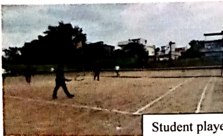
Student players performing in the events