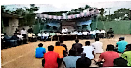
The Principal delivering his presidential address

Total 08 faculties of the college extended their contribution in the successful organisation of the events.